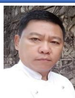
VING SAN 10000 RELIEF PACKS