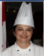
CORNELIA PARTNERSHIP MEDIA/PR WORLDCHefs