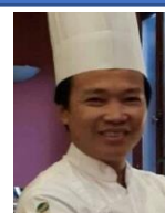
LONG BORA 10000 MEALS OPERATION