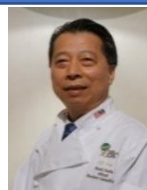
KK YAU GALA / CSR FRONT