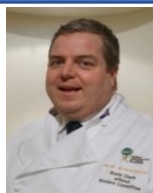
ARNI CONTACT RECRUIT AMBASSADOR